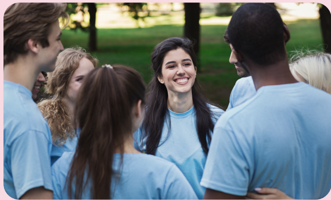
Image: Group of volunteers smiling

Encourage Welsh speakers to speak Welsh whilst volunteering. Show that your organisation sees the value of speaking Welsh by for example by having Welsh materials to hand and on display and identifying Welsh speakers ( using the Iaith Gwaith badge ) so that members of the public, staff and other volunteers can approach them in Welsh.