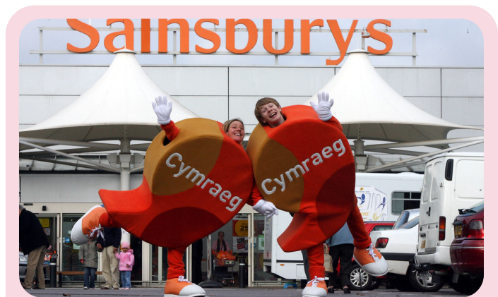
Image: Working Welsh Tour - Sainsbury's Cardiff by Working Word is licensed under CC BY-ND 2.0

By attracting more Welsh speaking volunteers, organisations can play their part in this national strategy, by increasing the use of Welsh in informal, social contexts and by increasing the delivery of bilingual services.